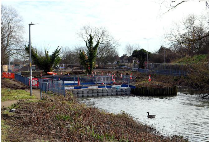
Padnall Lake, Mark's Gate

Unfortunately, our “Meet the Contractors” day couldn’t happen on Thursday 20th January due to Covid, however we are planning to reschedule the date soon and will share details via promotional flyers and social media.