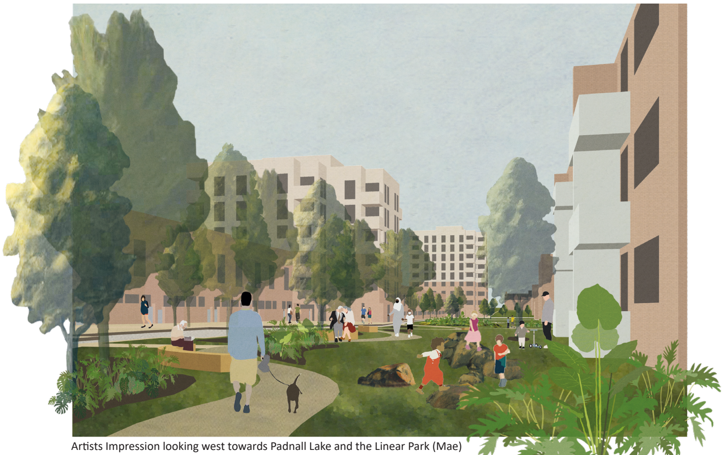
Artists Impression looking west towards Padnall Lake and the Linear Park

For more information and to request the consultation questionnaire by post please e-mail: communities@befirst.london