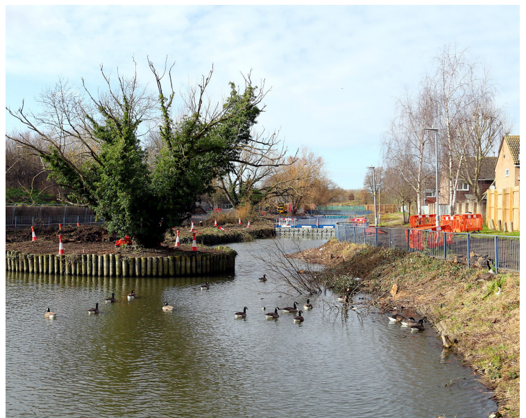
Padnall Lake, Mark's Gate

In addition to cleaning the lake, we have installed new gabions with wildfowl fencing affixed and prepared ground ahead of new planting. Finally, the hard landscaping works around the lake, including repairs and improvements of footpaths, will start in March and continue until all works are completed, and the lake reopened to the public this Summer.