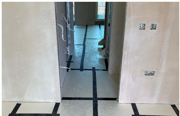
House 1 Under Floor Heating Preparation