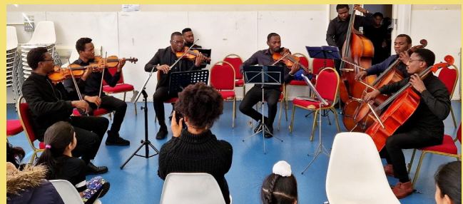
Performers from the East London School of Music