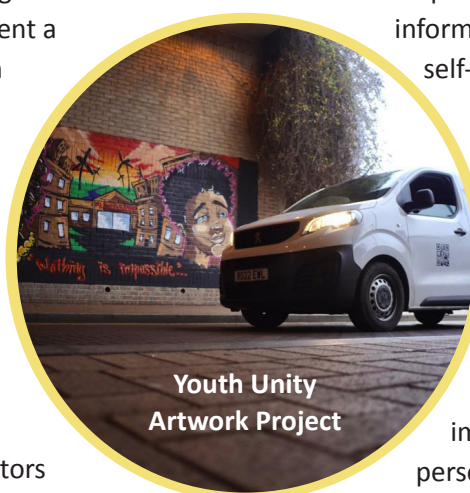
Youth Unity Artwork Project