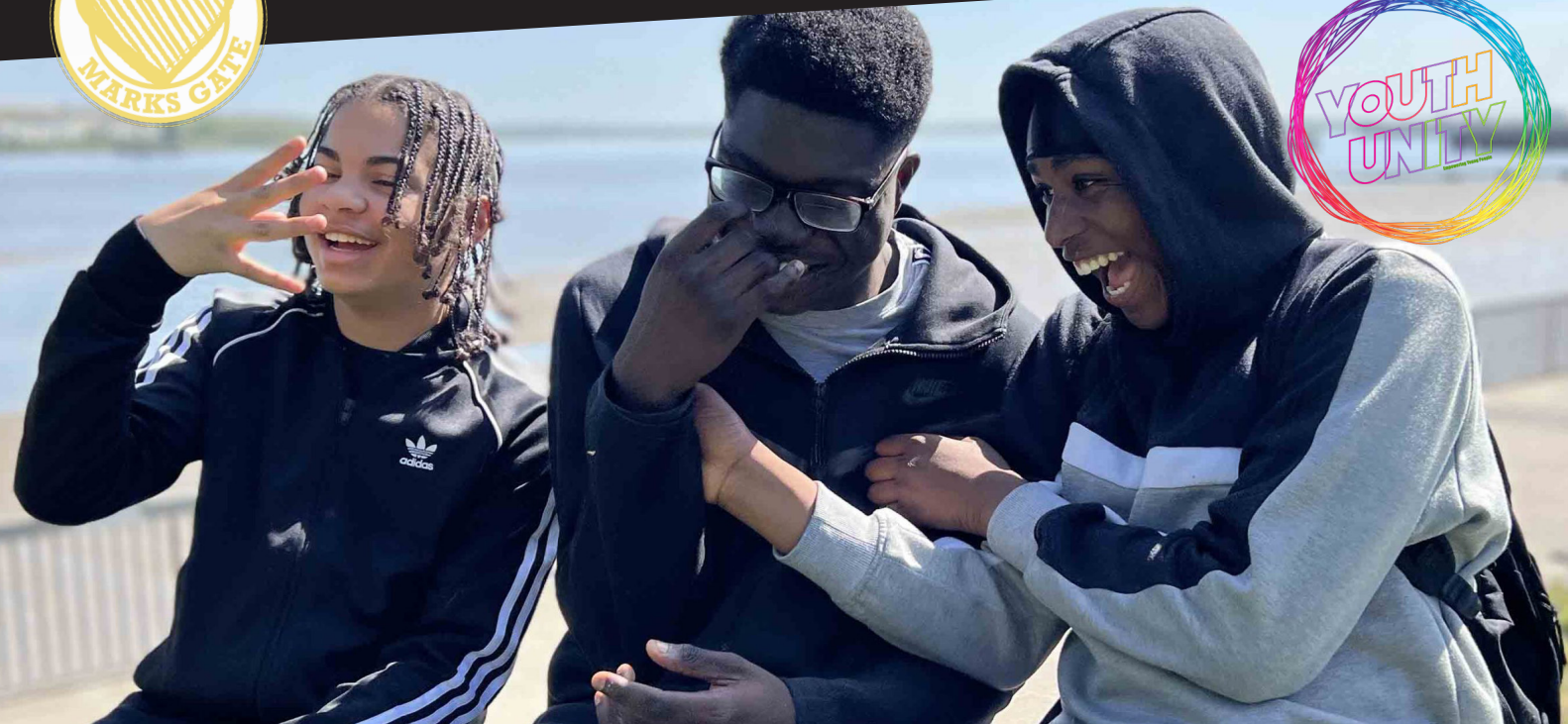
Youth Unity Ambassadors