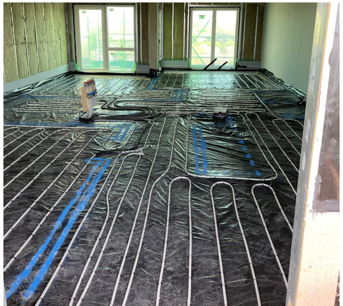
Block 1 Under Floor Heating Pipework

When visiting the lake, please avoid feeding bread to the ducks. Bread isn't nutritious and can encourage overcrowding, which results in an increase in droppings. Healthier alternatives include sweetcorn, lettuce, oats and seeds.