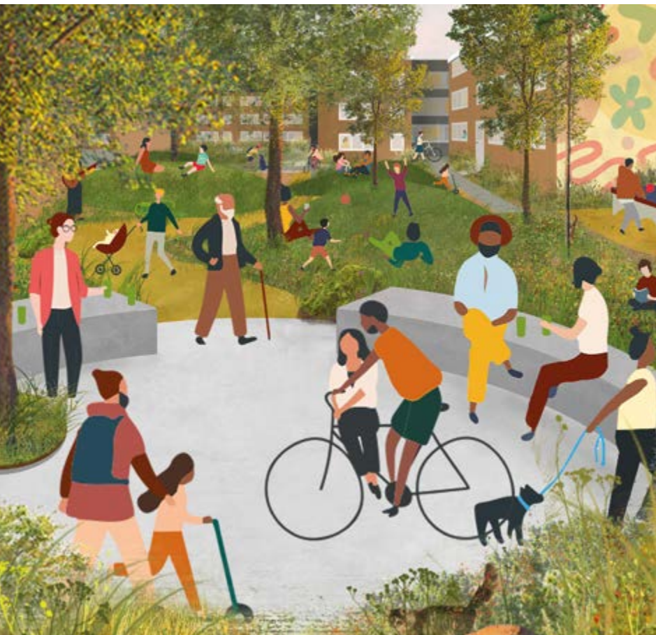
Artist's illustration of how the new, improved Gascoigne Road might look.